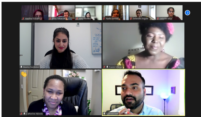
Figure 1. CTP Midway Point